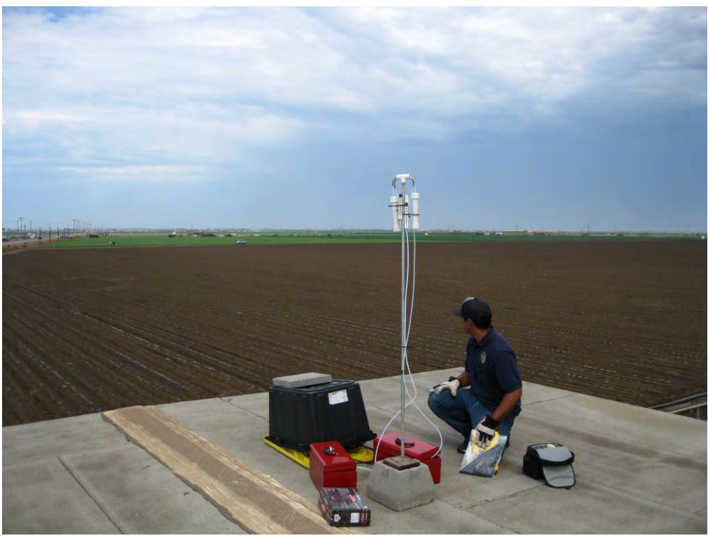
Figure 2: Bonita Elementary setup with two samplers.

At each monitoring location, air was drawn continuously through an XAD-4 sorbent tube during the 24-hour sampling period by either an AC or DC pump. Sample flow, targeted at 100 sccm ("Standard Operating Procedure for the Analysis of Trichloronitromethane (Chloropicrin) in Ambient Air using Gas Chromatography/Mass Spectrometry" located in Appendix 2), was controlled by an in-line rotameter during the sampling. Flows were measured using a NIST traceable digital Alicat Whisper mass flow meter (with a range of 0-200 sccm) at both the setup and retrieval of the samples. (The calibration certificate for the mass flow meter used is in Appendix 7.) The averages of the two flow values were used to calculate the volumes of the samples. Upon retrieval, sampled sorbent tubes were placed in a cooler with dry ice to keep below 4°C. As an example, Figure 2 portrays the setup at Bonita Elementary. Notice the PVC tube shielded the sorbent tubes from direct sunlight or rain.