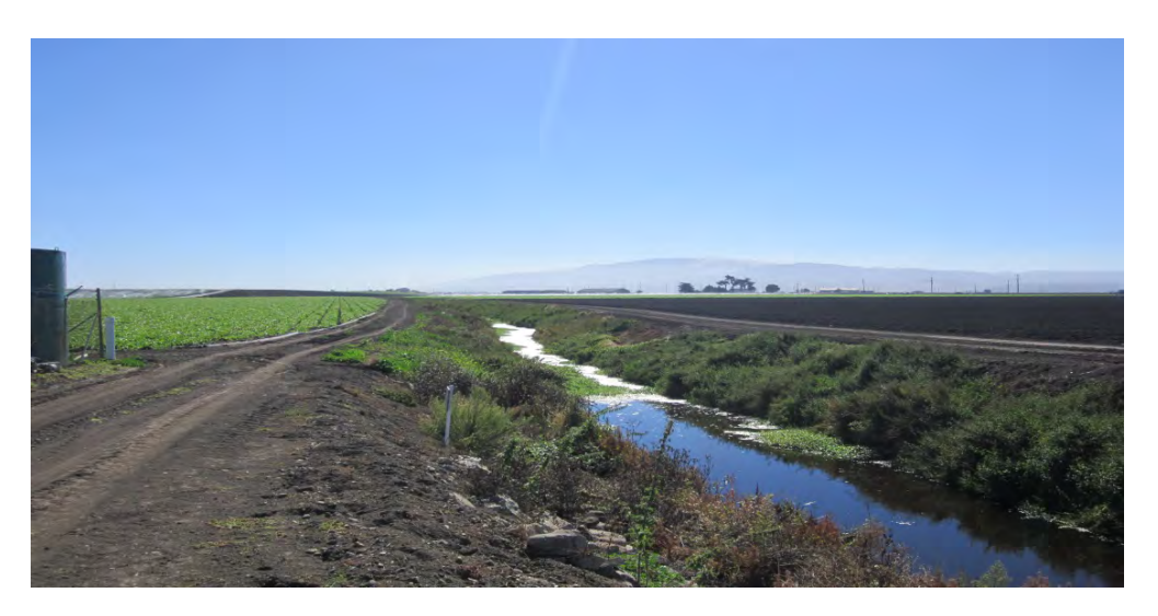
Appendix 5. Photograph of the agricultural field site in Salinas, CA.