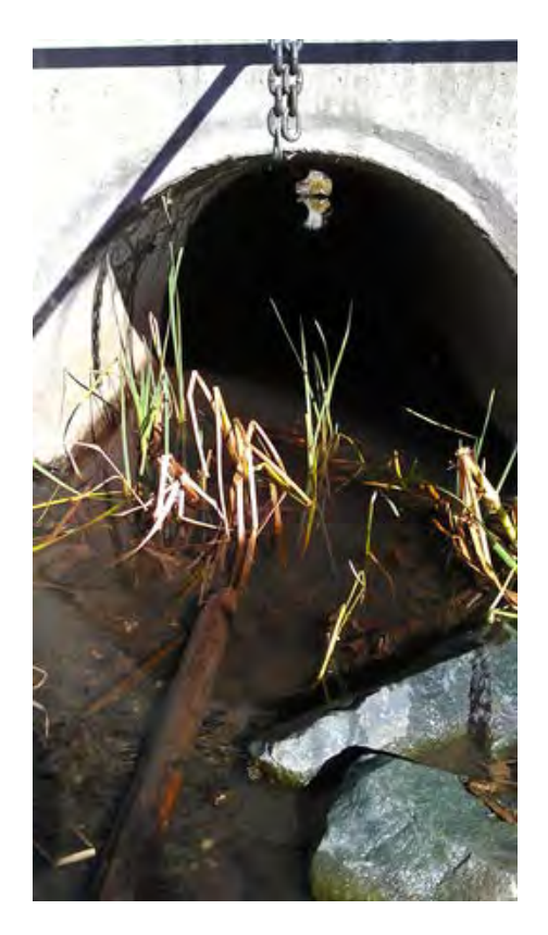
Appendix 4. Photograph of the urban field site in Folsom, CA (Folsom 1).