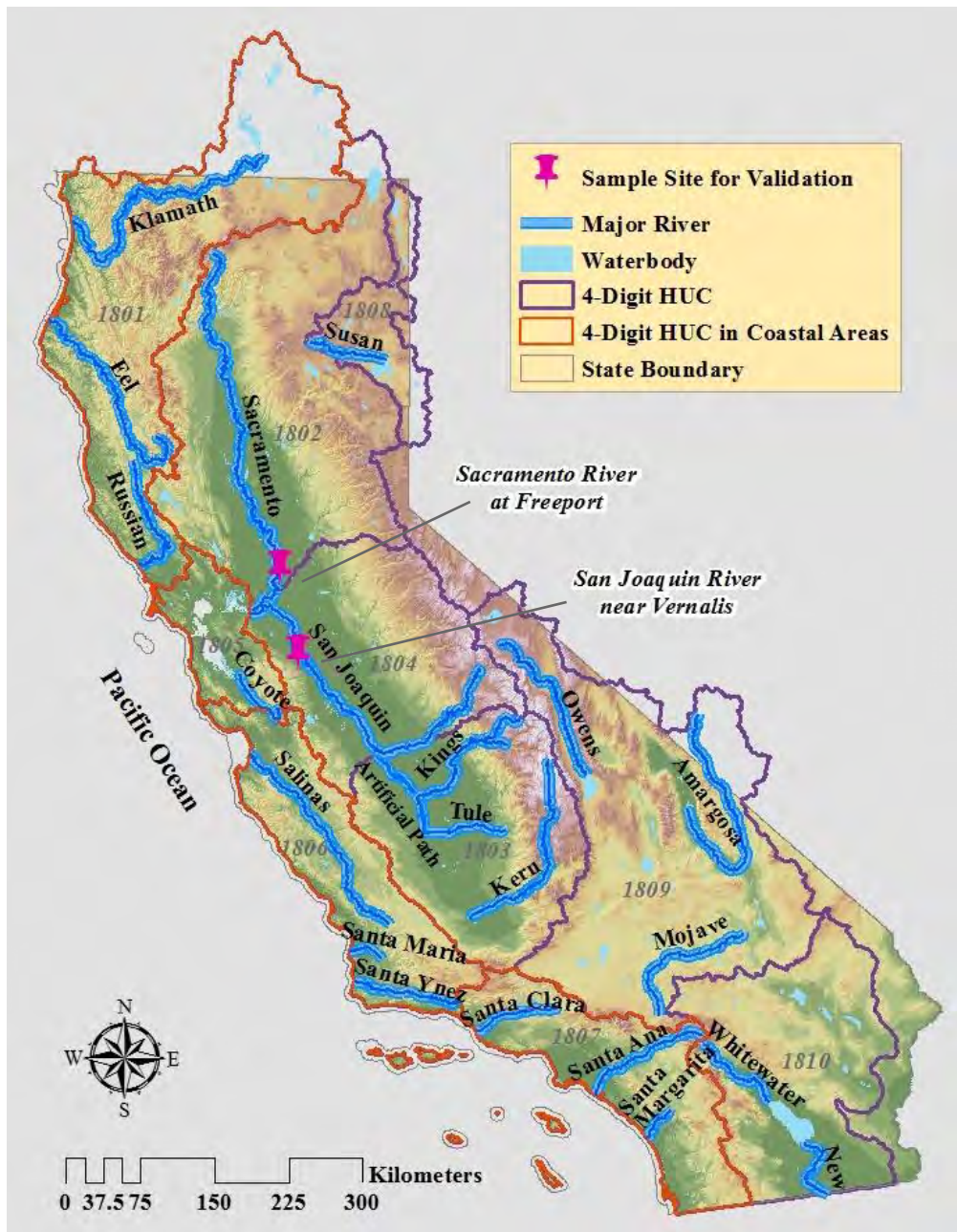
Figure 1: Location of 4-digit HUCs in California, and major streams and waterbodies in each HUC watershed, and water quality sample sites used for validation. Streamlines, waterbodies, and HUC boundaries are derived from the National Hydrology Dataset (NHD) ( http://nhd.usgs.gov/data.html ).

In addition to crop types, chemical properties are another critical indicator involved in the screening. Pesticides that have a high potential for off-site movement from soils and are highly persistent in aquatic environment may also have the ability to enter estuaries and the ocean even though they are applied outside of coastal areas. Screening by chemical properties is thereby a necessary supplement to the screening by commodity type to capture any chemicals posing a