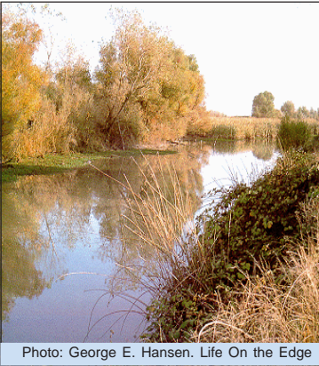
Life On the Edge

three stripes that can be pale, yellow or even orange. Along its side it has rows of black dots that may appear as a checkered or blotched pattern. Snakes emerging from dormancy are often muddy and may appear to be a solid, dark color.